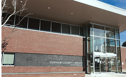
South Regional Library