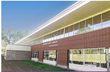
East Regional Library