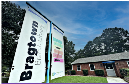
Bragtown Branch Library