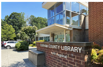
North Regional Library