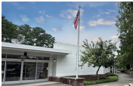
Southwest Regional Library